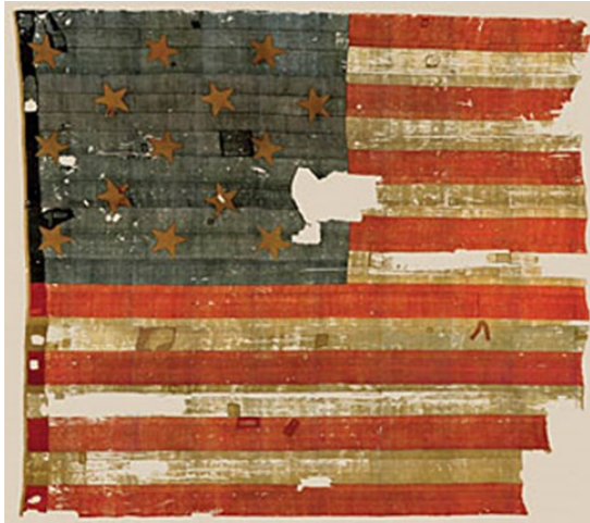
Original "Star-Spangled Banner" on view at the National Museum of American History

When the Brown family moved to Frankfort in 1801, the American flag had 15 stripes and 15 stars—one for each state, including Kentucky. In 1814 the flag pictured above survived a night of fighting during the War of 1812. Francis Scott Key celebrated by writing a poem, "The Star-Spangled Banner." You can celebrate a patriotic holiday by making a fan inspired by the 15-star flag.