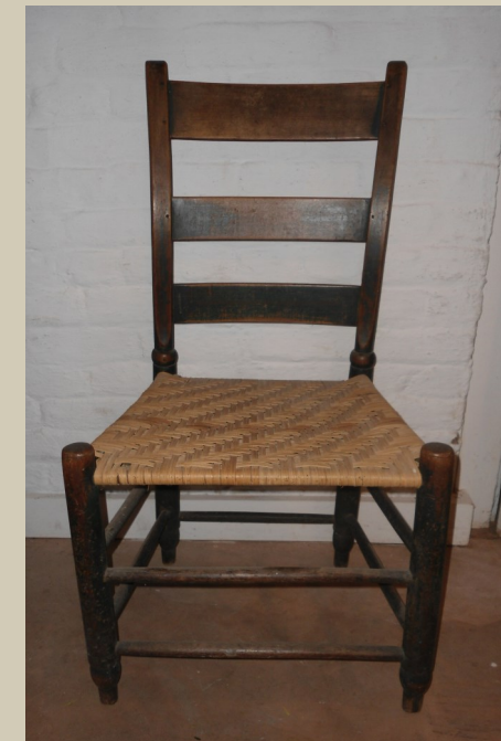
Ladder-back Chair , maple and hickory, made at the Kentucky State Penitentiary, mid-to-late 19th century