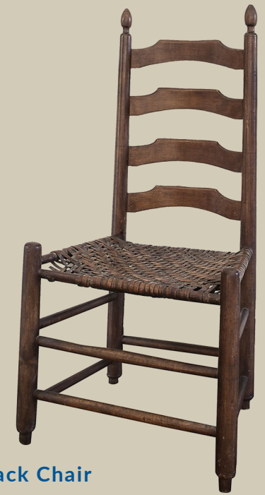
Ladder-back Chair Attributed to the King Family, undetermined wood/maple, 1850-1870