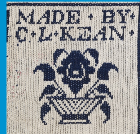
Figured and Fancy Coverlet, Carl Lewis Kean, wool and cotton, jacquard loom, ca. 1840