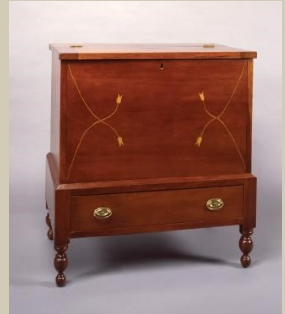
Sugar Chest , cherry with light wood inlay, ca. 1820