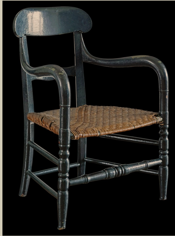
Continuous-Arm Fancy Chair , maple, cherry, and hickory, made at the Kentucky State Penitentiary, 1820-1850