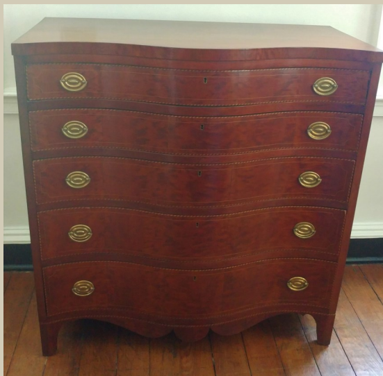
Serpentine Chest of Drawers , cherry, cherry veneer fronts with light and dark wood inlay, 1795-1810