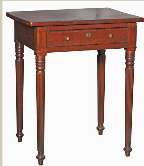
Worktable , cherry with mahogany cross-banding, ca. 1815