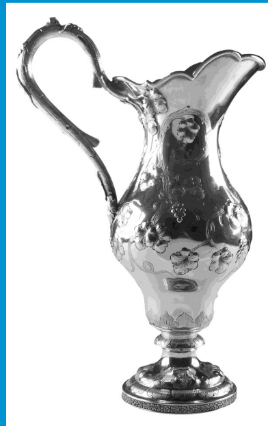
Presentation Pitcher, Hudson & Dolfinger, coin silver, repoussé grape cluster and vine decoration, 1855-1858