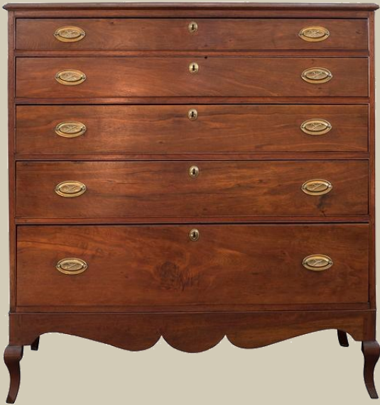
Chest of Drawers , attributed to the Mason-Fleming-Nicholas County Group, walnut and poplar, ca. 1815

Contrary to the state's backwoods image, a high degree of sophistication in art and furniture making existed in early Kentucky.