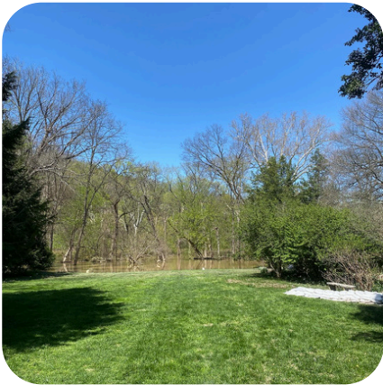
Historic Flood of 2025 - LHHs Garden

Liberty Hall Historic Site has had an incredible year. Despite various challenges, including changes in Executive Director and near record-breaking flooding, the staff and volunteers at Liberty Hall have continued to deliver exceptional programming that captures the unique history of the site. Their professionalism and passion for the site is evident in everything that they do. The NSCDA-KY deserve recognition as well. They have been exceptional stewards and have guided Liberty Hall through times of uncertainty with poise and dignity. Special thanks are due to the board members and volunteers who go above and beyond to support Liberty Hall and its staff.