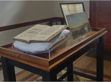
Conscious Merit & Virtue Exhibit Artifacts from LHHs Collection.

120: Cool KY Counties Open House with Frazier Museum Chocolate Stroll with Downtown Frankfort Inc. Irish Routes: The Emerald Isles to the Bluegrass