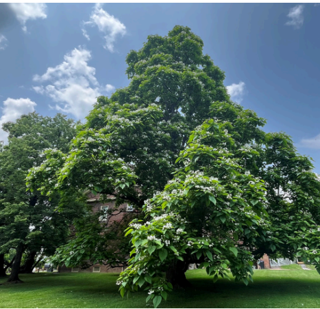
Catalpa Tree in Garden of Liberty Hall

Gifts to ARCS, the LHHS Endowment Fund, can be made in several ways: