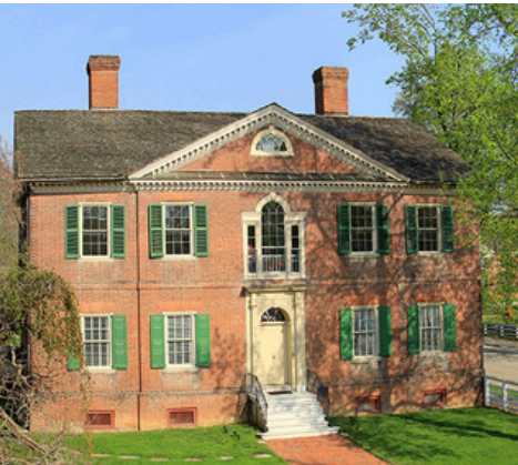
Liberty Hall, 1796

LHHS represents one of the fascinating stories of KY’s history. Here you can imagine indigenous tribes tracking herds, colonial officers discussing politics, devoted workers - both enslaved and free- building a new commonwealth, and civic leaders founding a capital city. Properties of such importance require investment and diligence to keep history alive. As owners of a National Historic Landmark, the NSCDA-KY holds the highest standard for conservation and preservation. Those goals are ongoing and expensive. You can help build an endowment fund that will maintain LHHS well into the future.